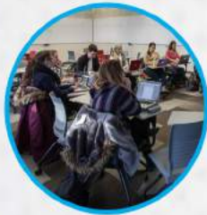
WRITEONWALLS @ CREATIVE WALLS & ACTIVE LEARNING ROOM