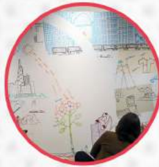
WRITEONWALLS@ CREATIVITY AT ITS BEST