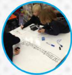
WRITEONWALLS @ DESKS/WALLS