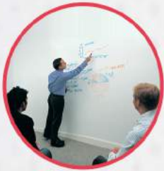
WRITEONWALLS @ TRAINING ROOM/ OFFICE: