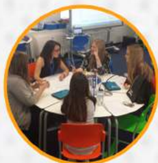
WRITEONWALLS @ DISCUSSION ROOM: