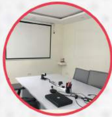
WRITEONWALLS @ MEETING ROOM