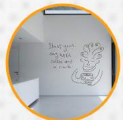
WRITEONWALLS @ IDEATION WALL