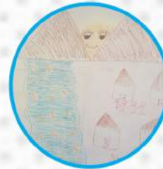
WASHABLE CRAYONS @ WRITEONWALLS