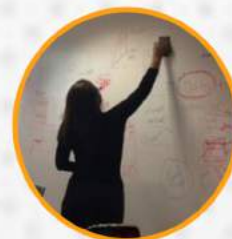
WRITEONWALLS @ TRAINING ROOM/ OFFICE